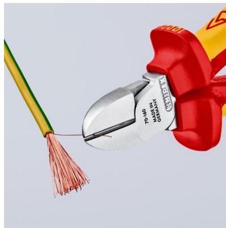
clean cutting of thin copper wires, also at the cutting edge tips